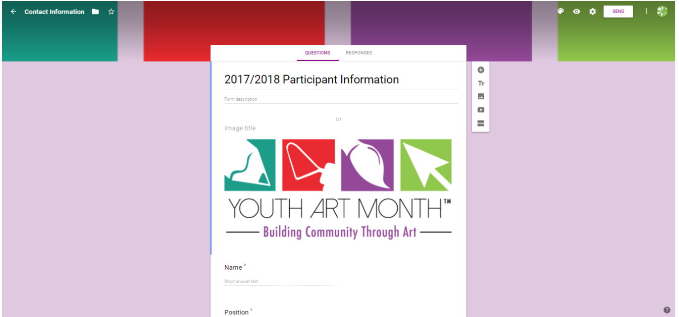
Survey in Edit Mode