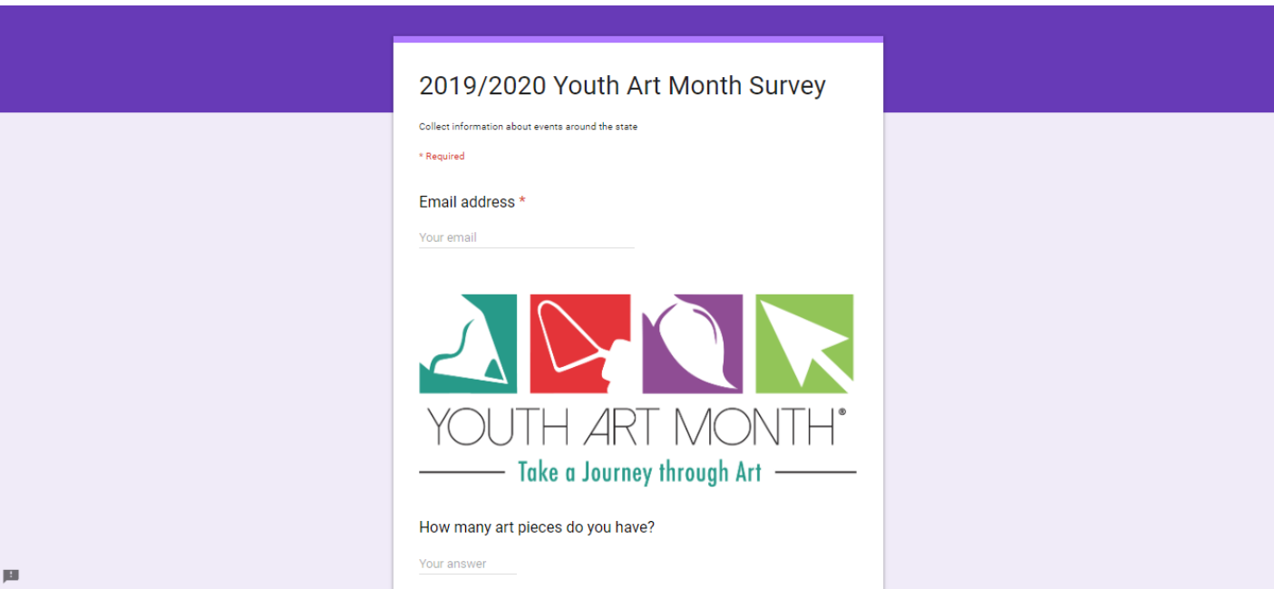
Survey in Preview Mode